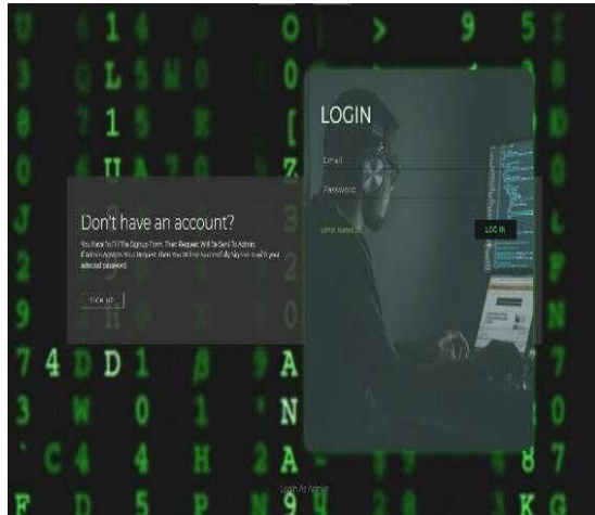
Fig.1.: Login Module

In this user have to sign up and after activation of account then police can login in the system.